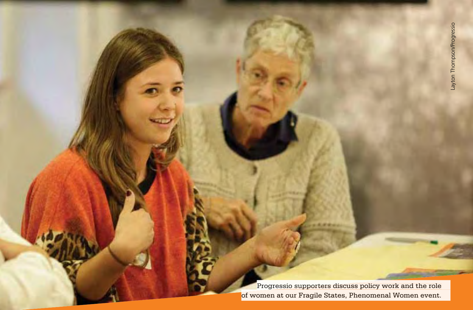
Progressio supporters discuss policy work and the role of women at our Fragile States, Phenomenal Women event.