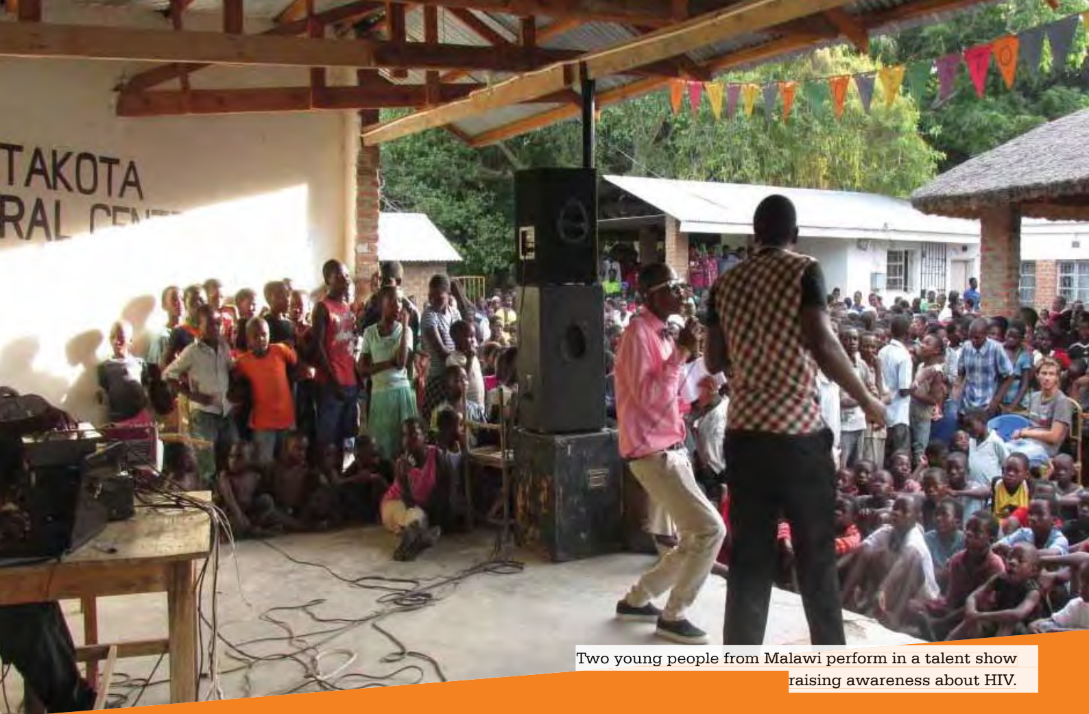
Two young people from Malawi perform in a talent show raising awareness about HIV.