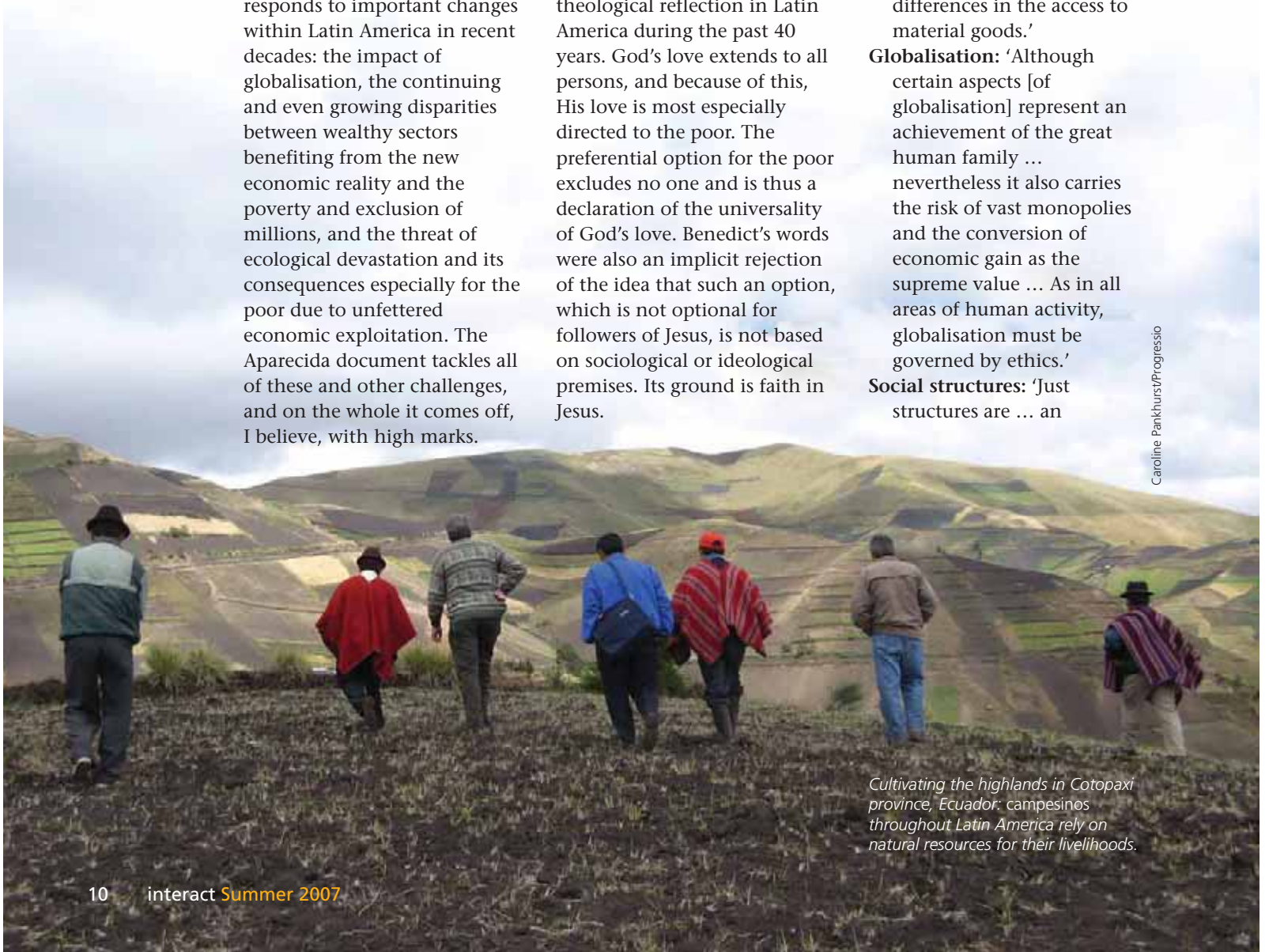
Cultivating the highlands in Cotopaxi province, Ecuador: campesinos throughout Latin America rely on natural resources for their livelihoods.