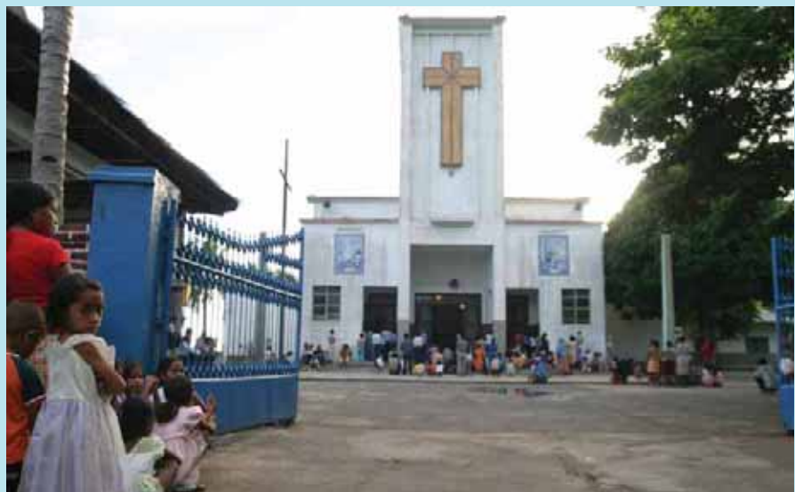
Going to church in Baucau, Timor-Leste: church recognition of grassroots communities is key to the formation of the church's people.

For the church and the formation of its people, the recognition of the importance of communities of the grassroots has never been more needed.