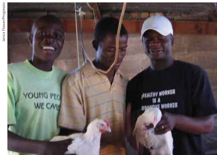
Young men at the poultry project.

The attitude of adults is sometimes to want to protect young people, thus underestimating their potential and preventing them from reaching out to others and contributing to their communities. The ‘Young People We Care’ concept was therefore introduced to encourage and enable young people to participate in caring for families infected or affected by HIV and AIDS. This concept, used in conjunction with other participatory methodologies such as Peer Education Training and the Stepping Stones Methodology, aims to encourage youths to support children, their peers and adults who are living in communities and are infected or affected by AIDS.